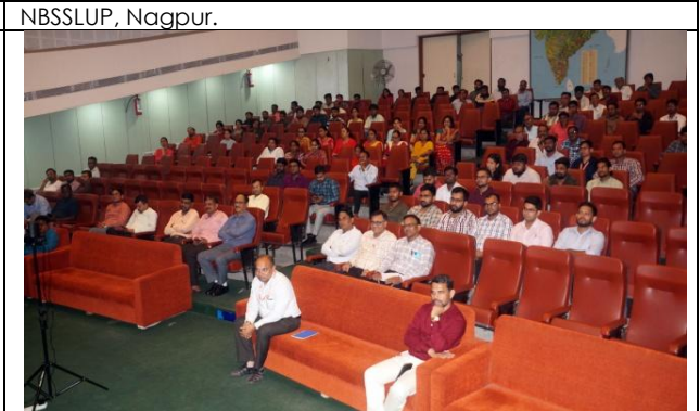
Staff of the Bureau at HQs Nagpur