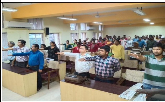
Integrity Pledge taken by Staff of ICAR-NBSS&LUP, RC, Kolkata