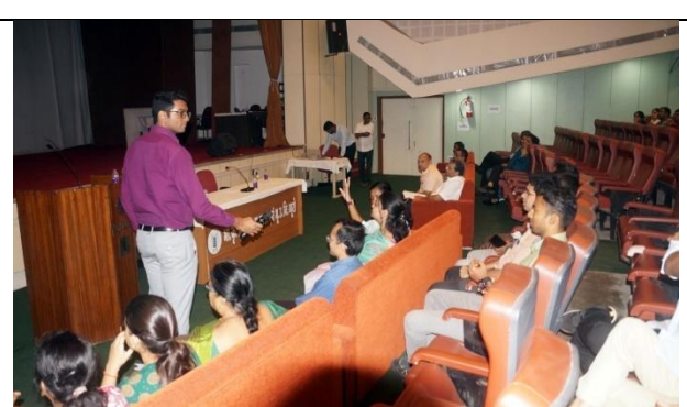
Ceremonial function and Prize distribution