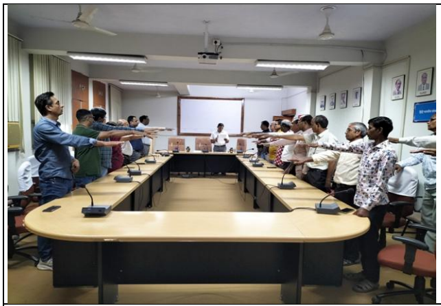
Integrity Pledge taken by Staff of ICAR-NBSS & LUP, RC, Udaipur on 30th October 2024