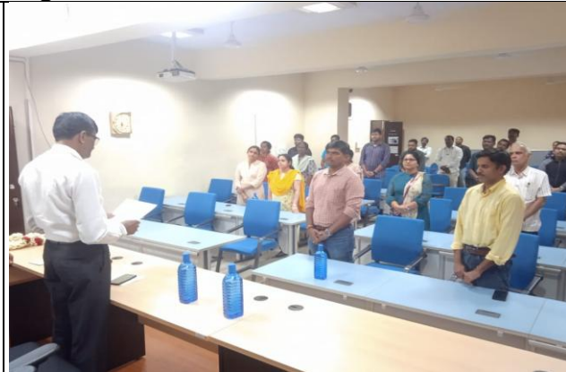
Integrity pledge by the staffs of ICAR-NBSS&LUP, RC, Bangalore